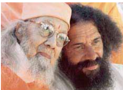
With his beloved master on his 95th birthday.

Guru has said: “Be compassionately detached.” When you can let your ego go, then life becomes very easy. When