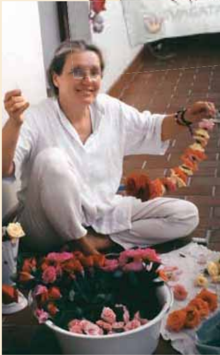
Offerings of devotion. Flower garlands are made in traditional Indian style to welcome Gurudev.